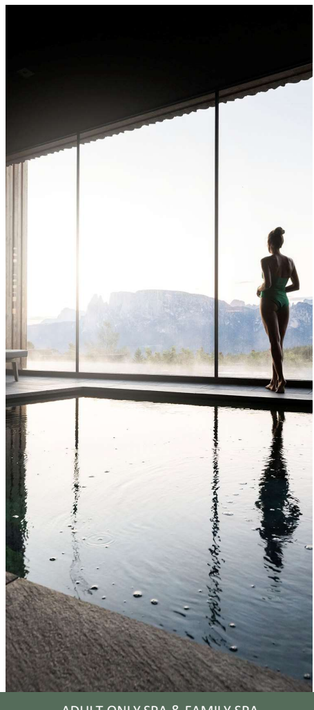
ADULT ONLY SPA & FAMILY SPA